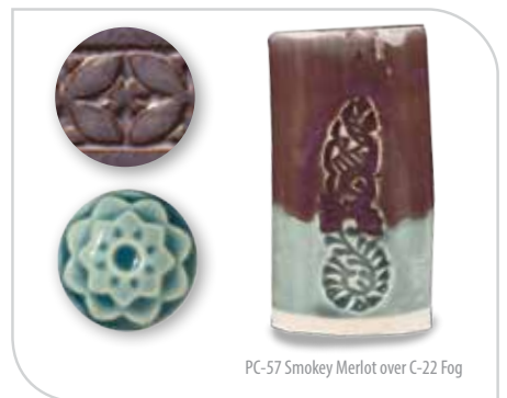
PC-57 Smokey Merlot over C-22 Fog

All test tiles are 3 brushed coats of top glaze over 3 brushed coats of base glaze on A-Mix 11-M Stoneware Clay. Samples were fired to Cone 6.