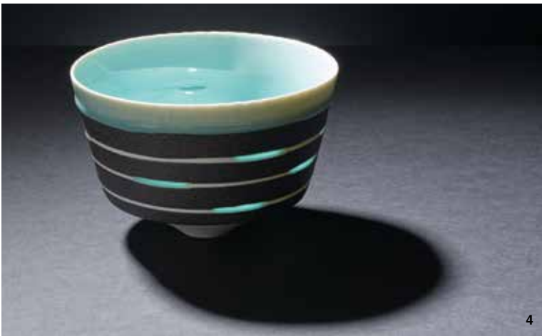
1–3 Sergei Isupov's Irish Dancer (side, back, and bottom views), 13 in. (33 cm) in height, porcelain, slip, glaze, 2014. "Sergei Isupov: Hidden Messages," at Erie Art Museum ( www.erieartmuseum.org ) in Erie, Pennsylvania, December 2–April 2. 4 Fritz Rossmann's bowl, porcelain, matte black glaze, celadon glaze, 2016. 5 Jean-François Foulhoux's Eagle Feather , 25½ in. (65 cm) in diameter, ceramic, glaze, 2016. 6 Takeshi Yasuda's untitled, 9 in. (23 cm) in height, porcelain, ice-break celadon, 2006. 7 Matthieu Robert's plate, 16 in. (41 cm) in diameter, porcelain, scaly celadon, 2016. "Celadon, a mysterious glaze practiced by contemporary potters," at Loes & Reinier ( www.loes-reinier.com/en ) in Deventer, The Netherlands, November 20–December 31.