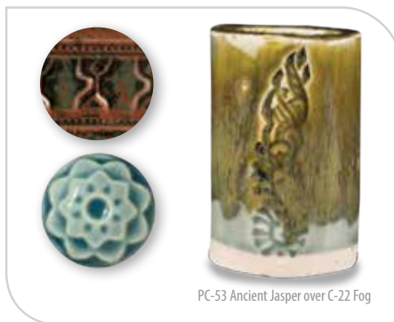
PC-53 Ancient Jasper over C-22 Fog