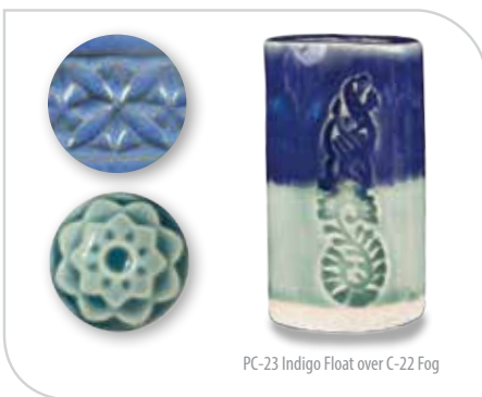
PC-23 Indigo Float over C-22 Fog