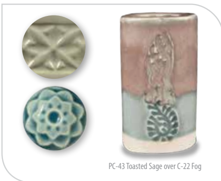
PC-43 Toasted Sage over C-22 Fog