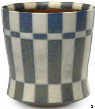
1 Lucie Rie's bowl, 6¼ in. (16 cm) in diameter, porcelain, glaze, ca. 1974. 2 Frances Senska's ring-neck bottle, 11 in. (28 cm) in height, stoneware, glaze, 1966. 3 Ursula Scheid's vessel, 6 in. (15 cm) in height, stoneware, glaze, 2006. 1–3 Photos: Brian Oglesbee. "Core Sample: Selections from the Permanent Collection," at Alfred Ceramic Art Museum ( ceramicsmuseum.alfred.edu ) in Alfred, New York, through March 1, 2017. 4 Ashley Kim's dotted bowls, 8 in. (20 cm) in length, stoneware, inlaid slip, paper-resisted underglaze, 2016. "Featured Artist Exhibition," at Red Lodge Clay Center ( www.redlodgeclaycenter.com ) in Red Lodge, Montana, November 4–December 23.