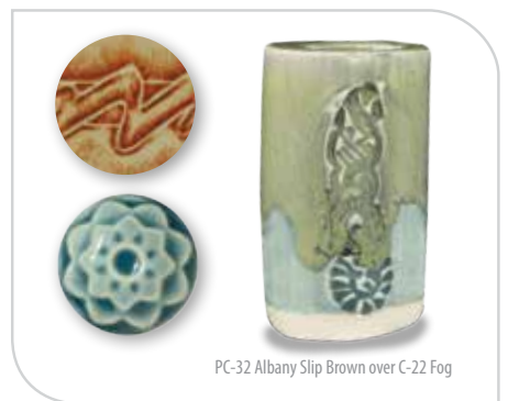
PC-32 Albany Slip Brown over C-22 Fog