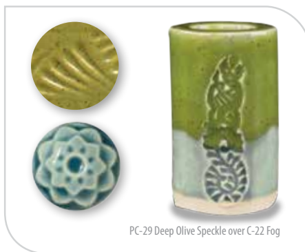
PC-29 Deep Olive Speckle over C-22 Fog